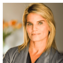
BOARD OF TRUSTEES