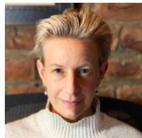
BOARD OF TRUSTEES