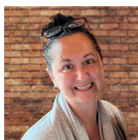
BOARD OF TRUSTEES